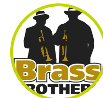
Brass Brothers Entertainment