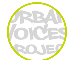
Urban Voices Project Chior